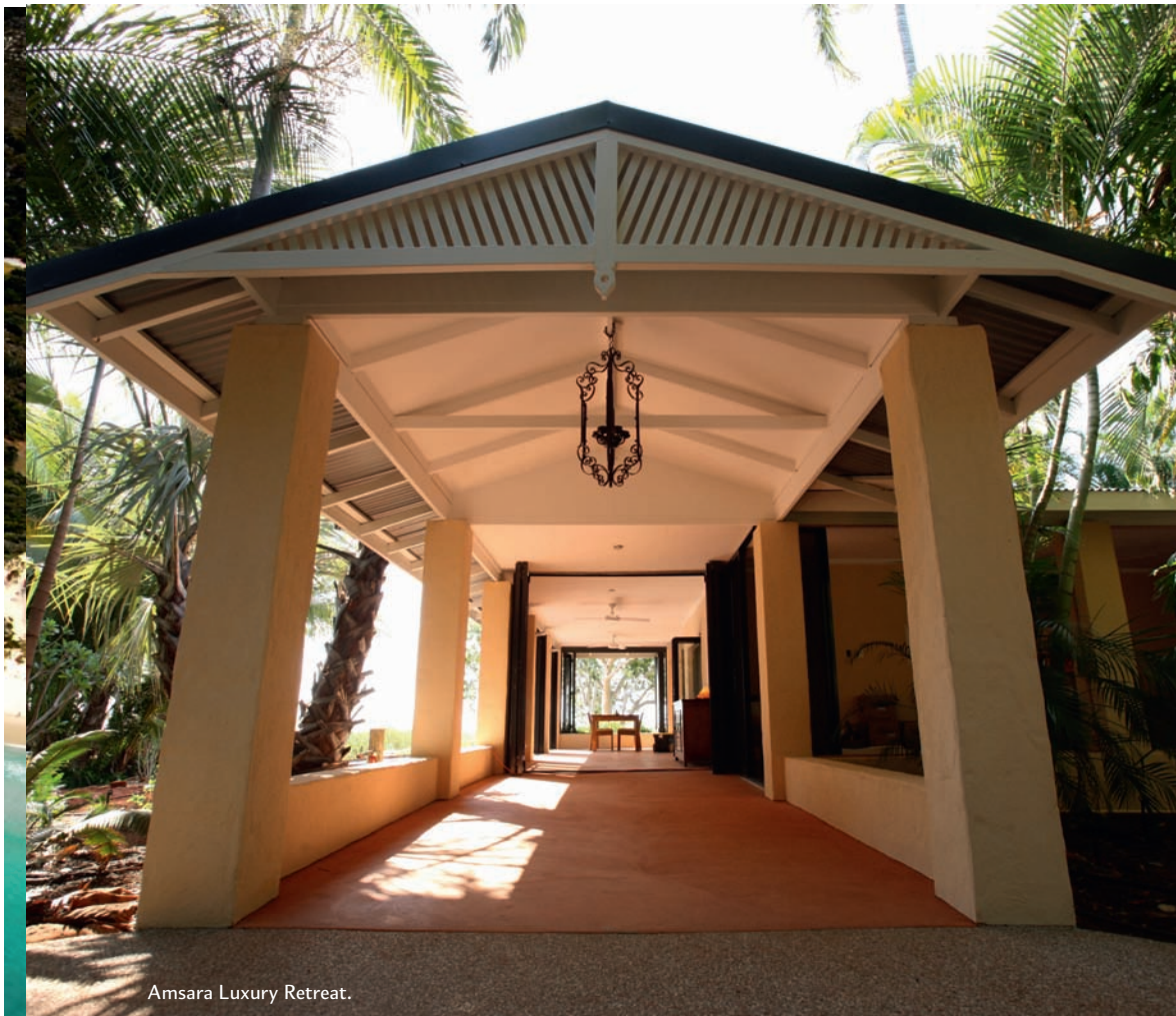
Amsara Luxury Retreat.