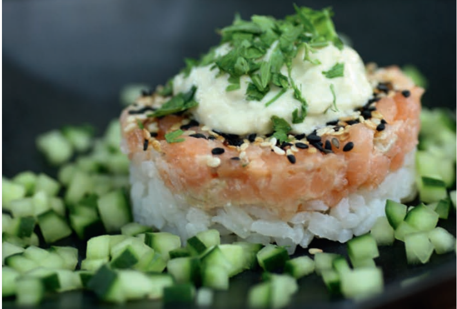
AMSARA LUXURY RETREAT: Some of the top food on offer. TOP RIGHT: Rooms are designed to bring the outdoors in. RIGHT: The view from the retreat.